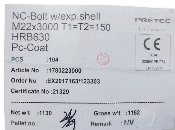
Standard label marked with certificate number

Certificates in compliance with EN 10204 3.1 are available for inspection. Approvals for bolts from the Norwegian Public Road Administration and Bane NOR (Norwegian Railway Authority) for use in Norwegian infrastructure tunnels are available on request.