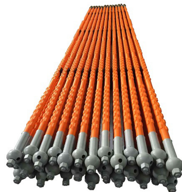
NC-Bolts packed on pallet.

We produce two types of combination bolts - NC-Bolt (rebar bolt) and PC-Bolt™ (tube bolt). Product data sheets and brochures for both bolt types can be downloaded from www.pretec.se