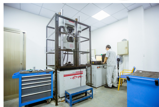
Pretec China laboratory