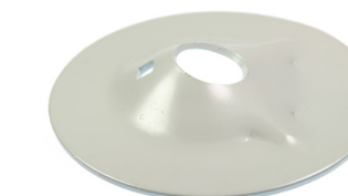
Spherical bearing plate