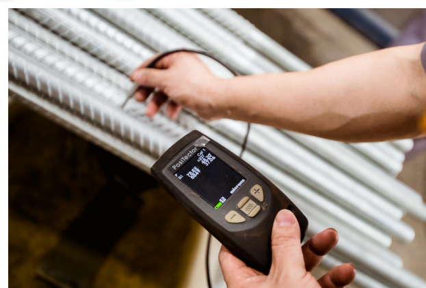
Control of coating thickness