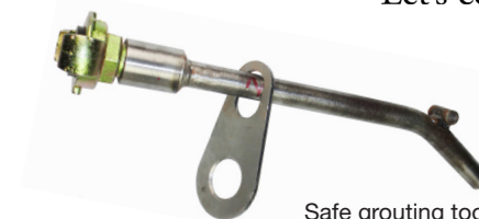
Safe grouting tool