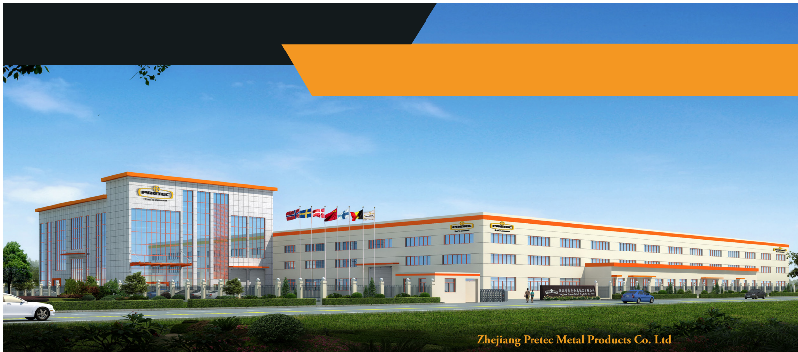
Zhejiang Pretec Metal Products Co. Ltd

Factory in Haining, Zhejiang, China. Total area: 22000 m 2 . Content: mechanical production, hot dip galvanizing and powder coating.