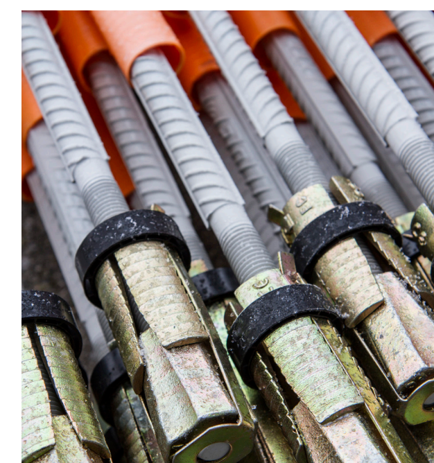
Nc-bolts with mounted expansion shells