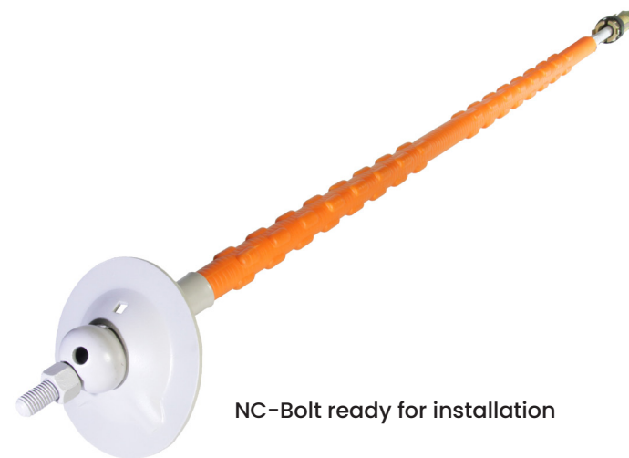
NC-Bolt ready for installation